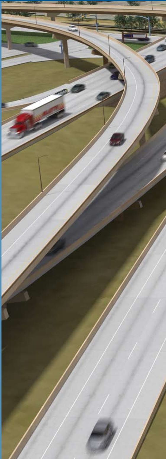
View of project at SH 26

The DFW Connector includes state highways 114 and 121 and adjacent roadways located north of DFW Airport. This area, which sits near the intersection of the area's four most populous counties, is a vital connection for North Texas business, commercial and recreational interests.